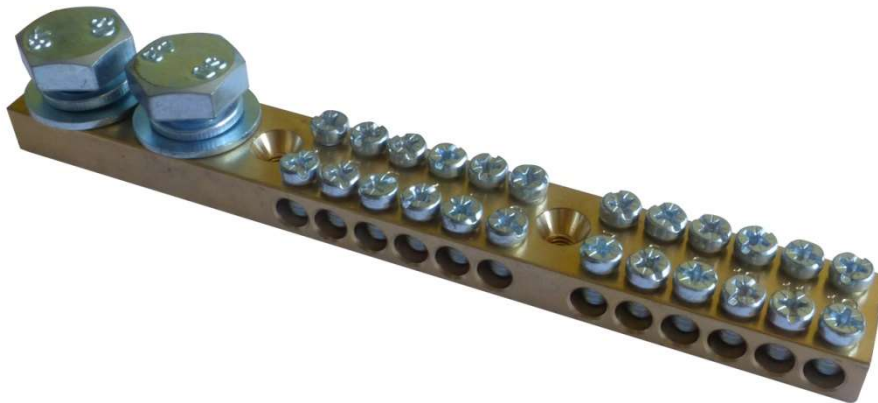
Example of MRS30xx product

Complete with M4 fixing screws, M10 screws for eyelet terminals and M5 galvanized steel connection screws.